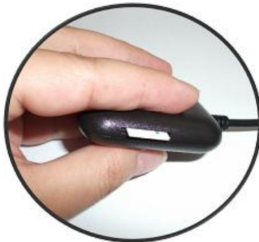
Insert the SIM card in the slot

To use the device, user should insert a SIM card in the device.